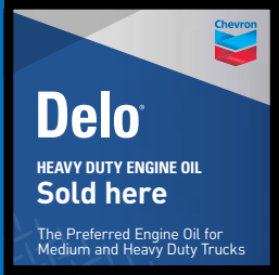
Illuminated Metal Sign (1) 4' x 4' with Lamps and Ballast.