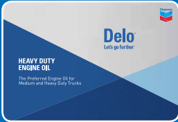
Delo Counter mat (1) 14" x 20". 10 mil. textured vinyl with 8 mil. rubber grip back.