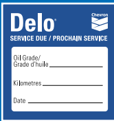
Static Cling Service Reminders (2 rolls of 500 each) 1 3/4" x 2 1/2".