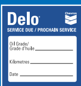
Static Cling Service Reminders (2 rolls of 500 each) 1 3/4" x 2 1/2".