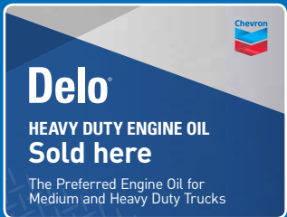
Delo Tacker Sign (1) Metal Tacker Sign 48" x 36"