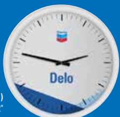
Wall Clock (1) 12" x 12"